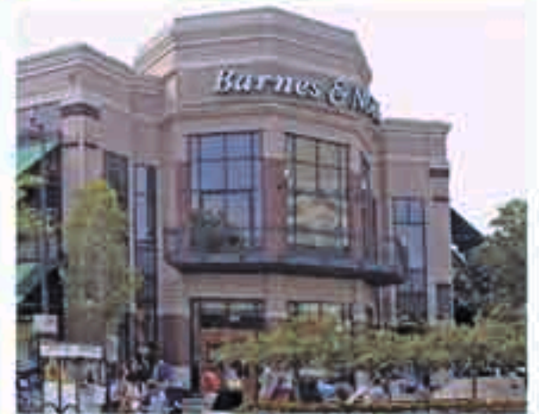
Image of "Smartcode Illustrated-Bethesda Row" from the U.S. Environmental Protection Agency (EPA) website. (Also found on pages 80 & 87 of the UNO-FBC.)

All images on this page are strictly illustrative of UNO-FBC urban design principles and standards. They are not, in and of themselves, regulatory. Unless otherwise noted, all other photographs and axonometric drawings are courtesy of Galvin Architects.