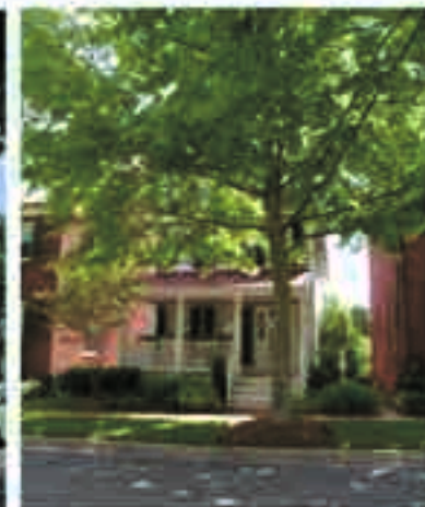
Image of townhouses in Harbor Town, Memphis, Tennessee courtesy of Looney Ricks Kiss Architects, Inc. (Also found on pages 100, 110 & 113 of the UNO-FBC.)